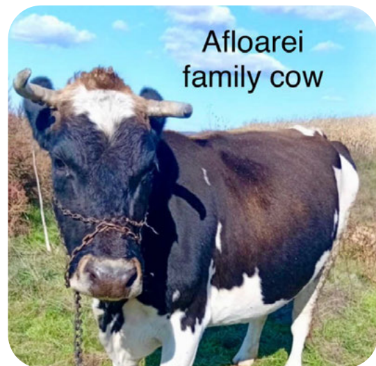
Afloarei family cow